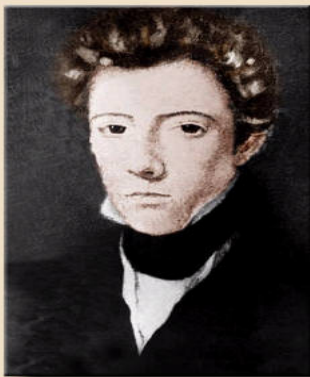
Dr. JAMES MIRANDA BARRY (1789 - 1865) Transgender British Surgeon

Most countries of the world now provide women with equal access to medical education. However, gender equality is yet to be achieved within medical specialties around the world.